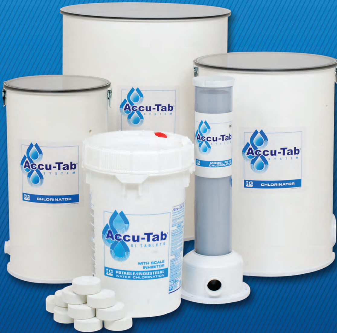
Clockwise from top: Model #3530, #3150, #3012, Accu-Tab tablets, and model #3075.

Accu-Tab chlorinators are made of rigid PVC with a wide range of sizes available to meet any chlorination need or requirement. With few moving parts, Accu-Tab chlorinators offer low maintenance and eliminate any concerns of spills or leaks.