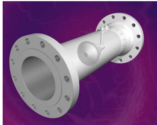
Figure 1. V-Cone Flow Meter

A-B-T made the recommendation based on the V-Cone's ability to provide reliable accuracy in less than ideal piping conditions and low-maintenance design with a no moving parts design.